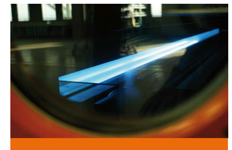
HT coated glass